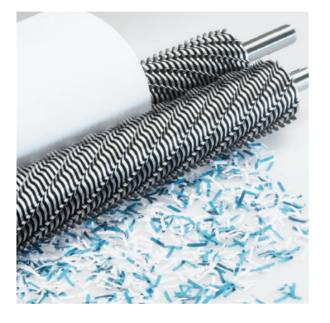
SOLID STEEL CUTTING SHAFTS

Robust and durable: high-quality paper clip proof cutting shafts with lifetime guarantee under conditions of fair wear and tear.